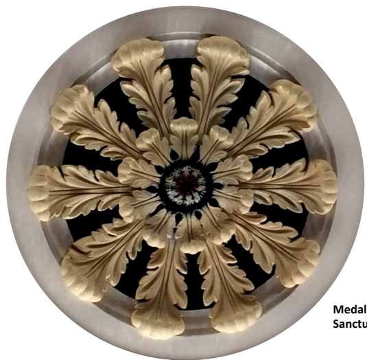
Medallion, Sanctuary Arch

Welcome to First Parish Dorchester, our Unitarian Universalist religious community.