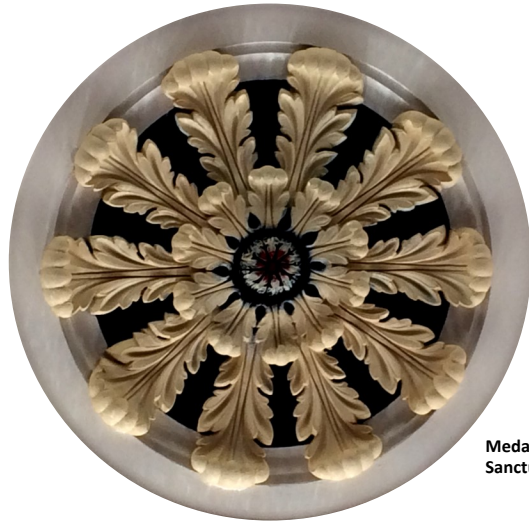
Medallion, Sanctuary Arch

Welcome to First Parish Dorchester, our Unitarian Universalist religious community.